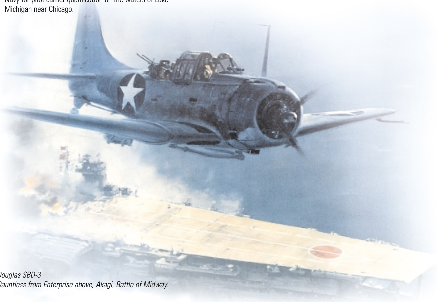
Douglas SBD-3 Dauntless from Enterprise above, Akagi, Battle of Midway.

In the early 1940's, Chicago was a central training ground for allied pilots, aircraft carrier officers and crew. Two former excursion vessels, the Wolverine and the Sable, were fitted with flat tops and commissioned by the U.S. Navy for pilot carrier qualification on the waters of Lake Michigan near Chicago.